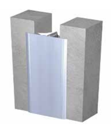
Corner Application HDC