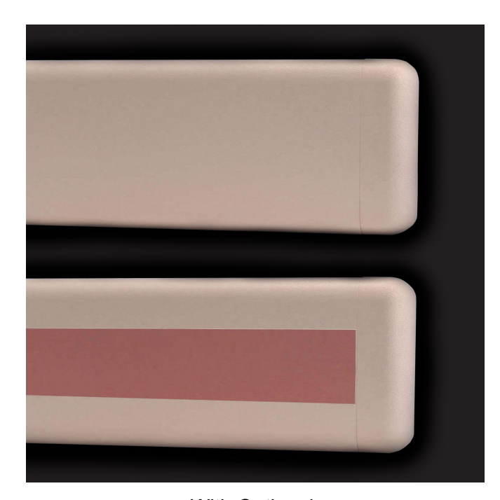
With Optional Accent Strip