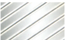
SILVER ANODIZED (SA)

Note: Other anodic finishes available on request.